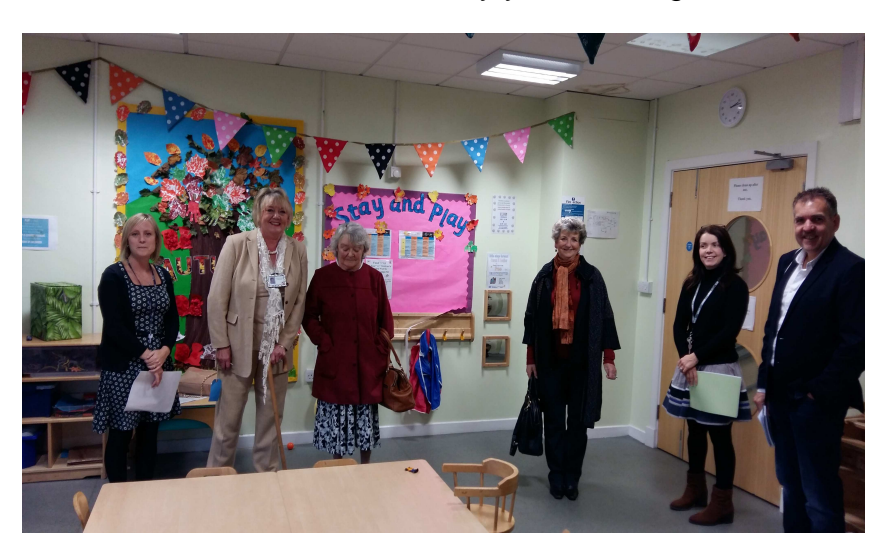
Visit to Children's Centre in Penlan

3.8.7 Flying Start/Children's Centres providers have parental inclusion and involvement built into every part of their work with children, from working with pregnant women, young mothers and dads through to the transition to school as children leave the early years setting.